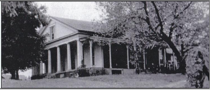
Danville and Boyle County in the Bluegrass Region of Kentucky, 1999, p50